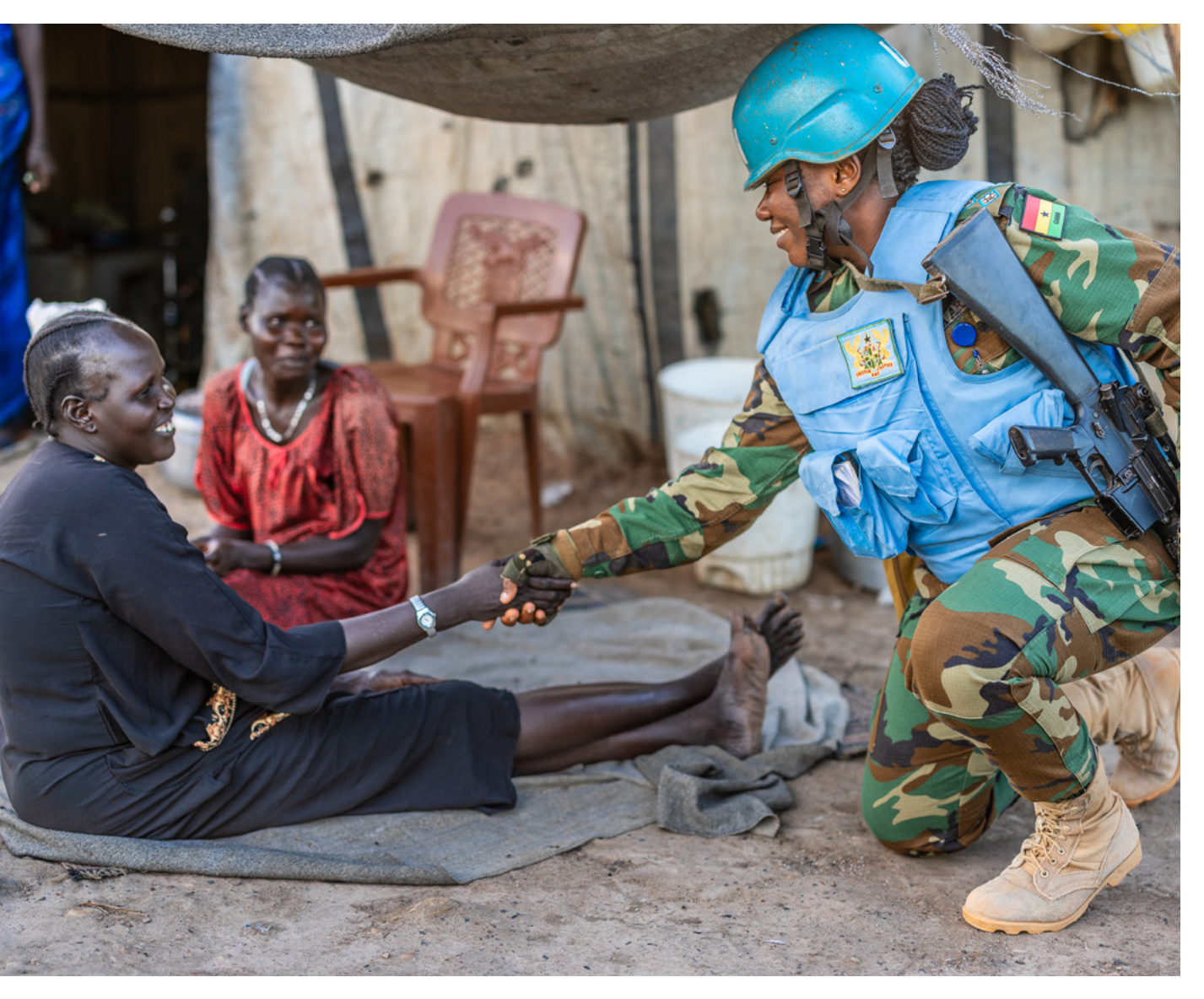
Ghanaian peacekeepers pictured during a patrol in the Internally Displaced Persons camp in Bentiu, South Sudan, on 30 October 2021.

funding for human rights components within budgeting processes via the Fifth Committee of the General Assembly are growing stronger, while many Member States are shifting emphasis toward more militarised actions. The findings of this study point in the opposite direction: if peace operations are to become more effective presences on the ground, capable of address ing both the immediate causes of violence and the deeper drivers of instability, they will need to be capacitated with robust human rights mandates and components and strong support from the broader UN architecture and Member States .